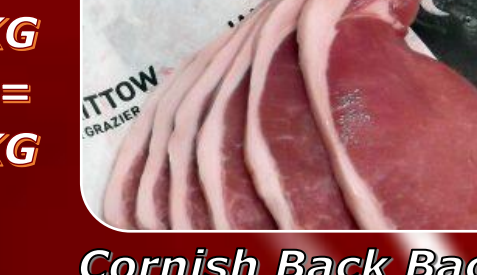
Cornish Back Bacon

♦ Smoked = £9.39 per KG ❖ Unsmoked = £9.00 per KG