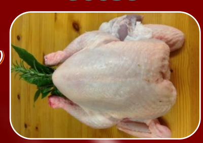
Whole Devonshire Chicken