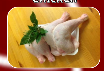
Devonshire Chicken Legs