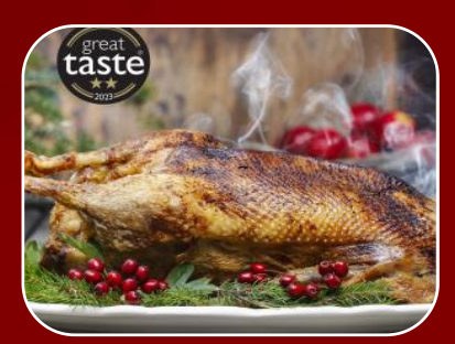
Whole Cornish Goose